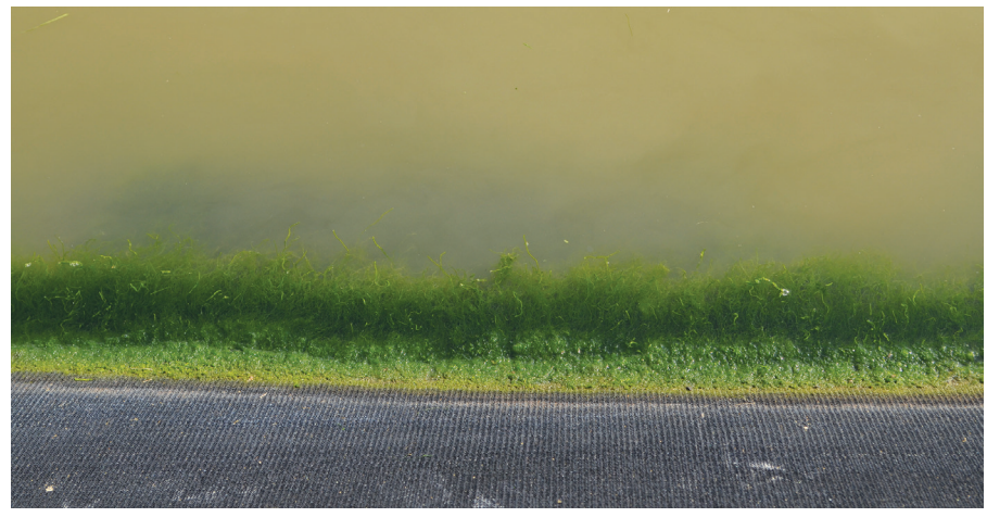
Blue green algae in affected pond.

consumed. Low levels are typically not problematic and World Health Organisation (WHO) has established acceptable threshold levels of these toxins. However, there are serious concerns that some of these toxins may pose short and long-term threats to consumers that eat them. Food poisoning from consuming toxins such as nodularin and microcystin does occur; the more fish and shrimp are produced in the same contaminated environment the risk is certain to increase. Consumption of water containing various toxins has resulted in hospitalisations and even in some cases human deaths. Animal deaths are common.