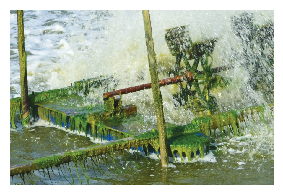
Blue greens on paddle wheels.

Given the nature of these bacteria, it is very unlikely that they can be eliminated entirely from production systems. The goal should however, to be to manage around them and take proactive steps to reduce their numbers through whatever means there are available. Controlling the growth of these