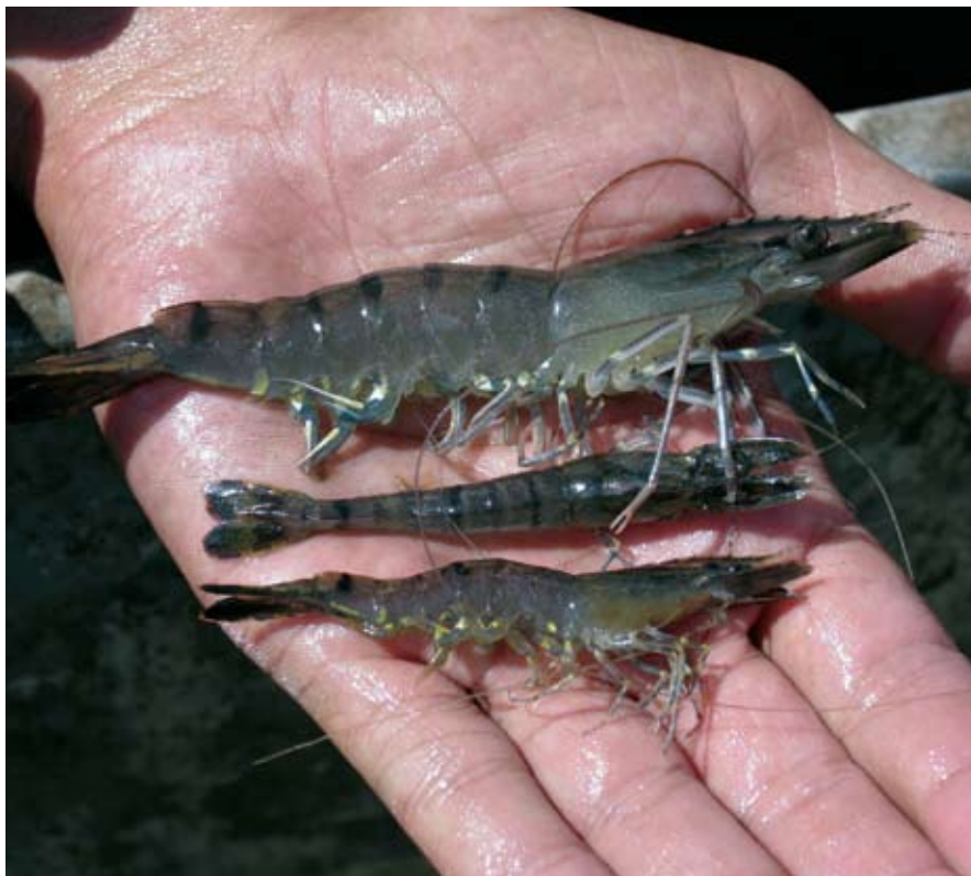
Failure to proactively address disease issues usually leads to significant decreases in production performance.